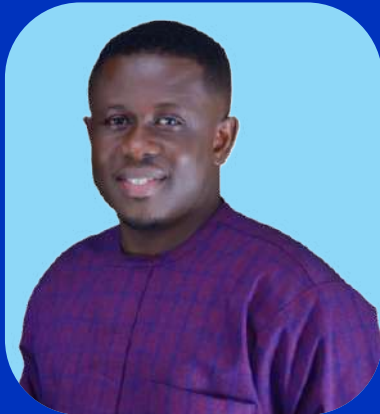
Hon. Dr. Benjamain Yeboah Sekyere Deputy Minister for Gender, Children and Social Protection