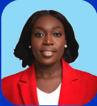
Hon. Newman Dakoa Minister for Gender, Children and Social Protection